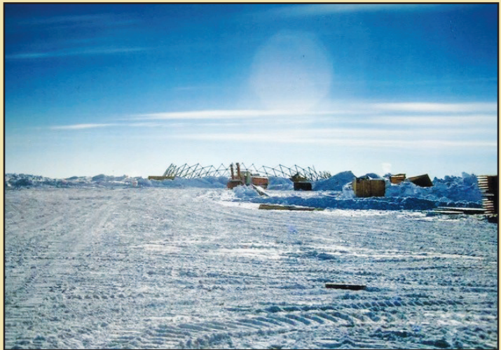
The Geodesic Dome in its early stage of construction (above) and upon completion (below). The sun belies the extreme cold!