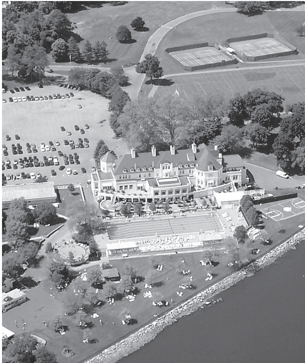
NYAC SUMMER FACILITY—TRAVERS' ISLAND

GOLF IN MORNING LEEWOOD GOLF CLUB PELHAM COUNTRY CLUB CLAMBAKE - TRAVERS' ISLAND REGISTRATION 11:30 A.M. to 5:00 P.M. LUNCH 11:30 A.M. to 2:00 P.M. OUTDOOR GAMES 2 P.M. to 5 P.M. TUGBOAT RIDES SURF & TURF DINNER SERVED AT 5:30 P.M.