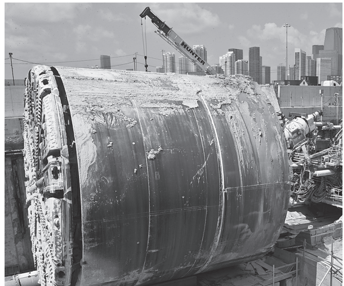
PORT OF MIAMI TUNNEL PROJECT