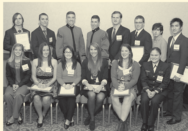
Student Award Recipients