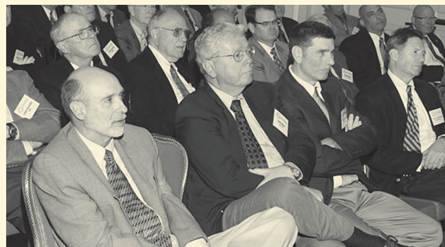
Listening intently to Lecture on No. 7 Line Extension