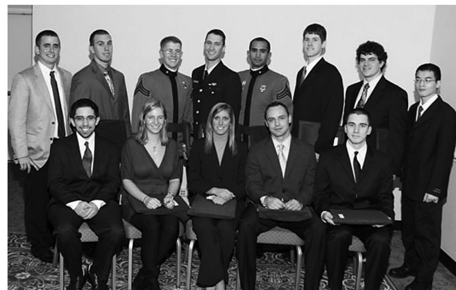
Student Award Recipients