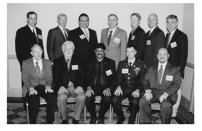
Faculty Members present at Dinner