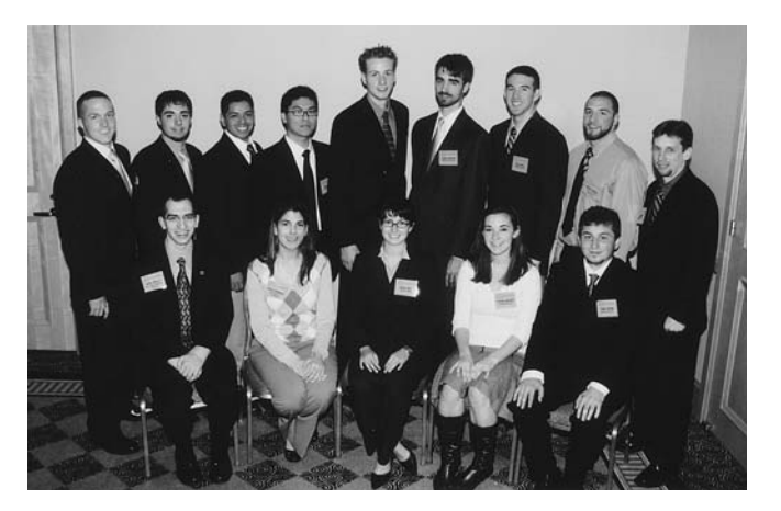
Scholarship Recipients present at Dinner