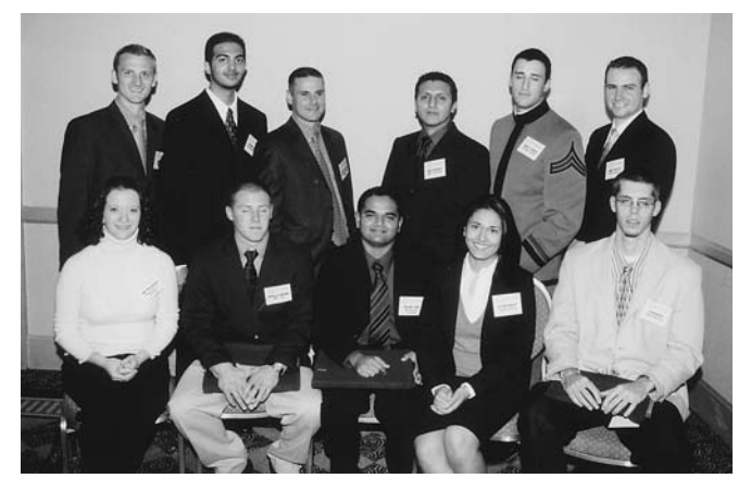
Student Award Recipients present at Dinner

Following the practice of many years, recipients of The Moles Student Awards and Moles Scholarships, along with faculty members, were invited to a special reception hosted by The Moles Education Committee and all stayed on for the ensuing Lecture, Reception and Dinner.