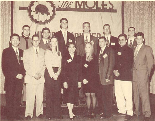
Some of the Student Award and Scholarship recipients.