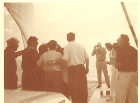
A sunset cruise on the catamaran Sweet Liberty