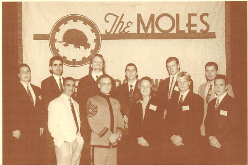
Student Award Recipients come together for group photograph.