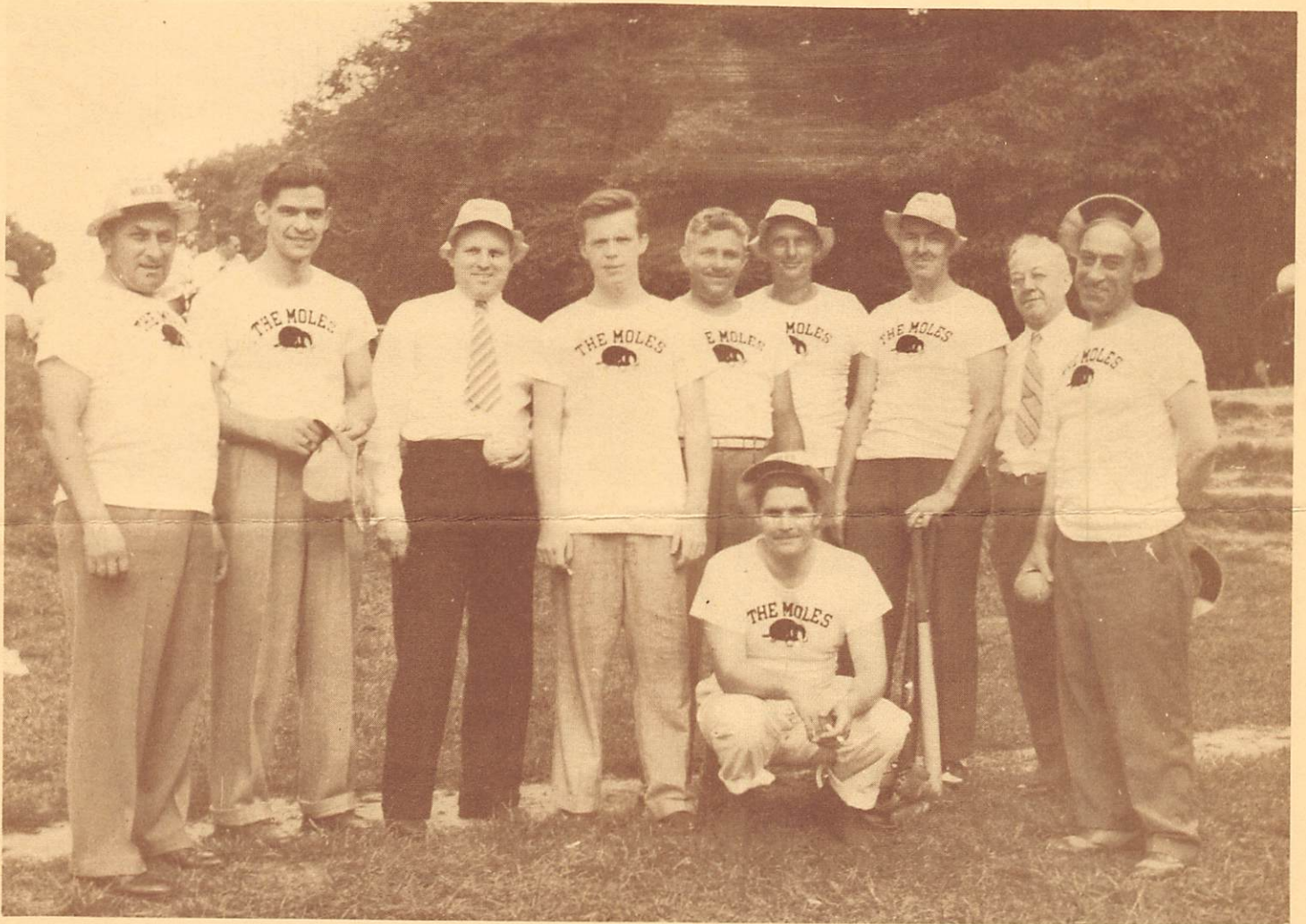
The Moles soft-ball team won the big game at the annual Clam Bake from the N. Y. Department of Public Works team. Some players evaded the picture but "ringers" took their places.